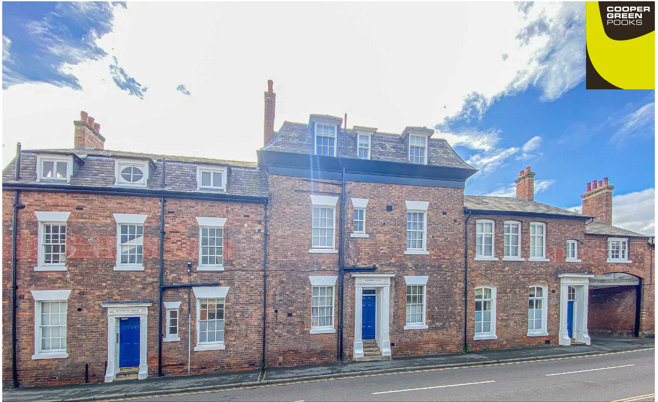
9, Severnside House, Coleham, Shrewsbury, SY3 7EJ £575 Per Month